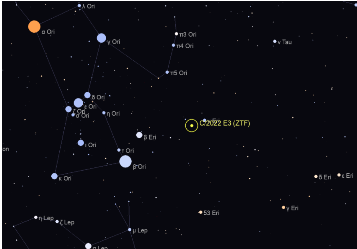
Figure 3 - Map showing Comet C/2022 E3 (ZTF) in Eridanus on March, 14 2023.

talmudists are so far in front of many of us in predicting what the future may hold, and maybe we are heading for some significant conflict in the future?