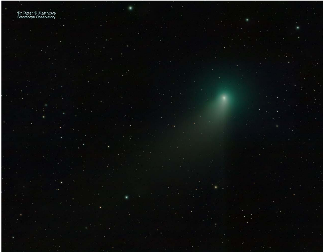
Figure 1 - C-2022 E3 (ZTF) Comet taken 16 February 2023 from Stanthorpe Observatory heading towards the Conjunction of Jupiter and Venus. https://telescopius.com/pictures/view/143955/comet/by-stanthorpe-observatory

In the mid-16 th century, comets were viewed as significant omens in the sky, especially by a number of early London astronomers, though this thinking dates all the way back to the ancient Greeks with a story from Antoninus Liberalis' Μεταμορφώσεων Συναγωγή (Metamorphoses Synagogue), where two young women, Metioche and Menippe, sacrificed themselves to stave off a plague upon their people and Persephone and Hades took pity on them. 1 They metamorphosed Metioche and Menippe into comets with curved tails. 2 London astronomer and poet Leonard Digges (1588-1635AD), son of Muster-Master General and astronomer Thomas Digges (1545-95AD), and grandson of scientist and astronomer Leonard Digges (c. 1515 – c.1559), 3 published his father's manuscript, Pantometria , and wrote of the many telescopes his father was involved with, including his father's earliest reflecting